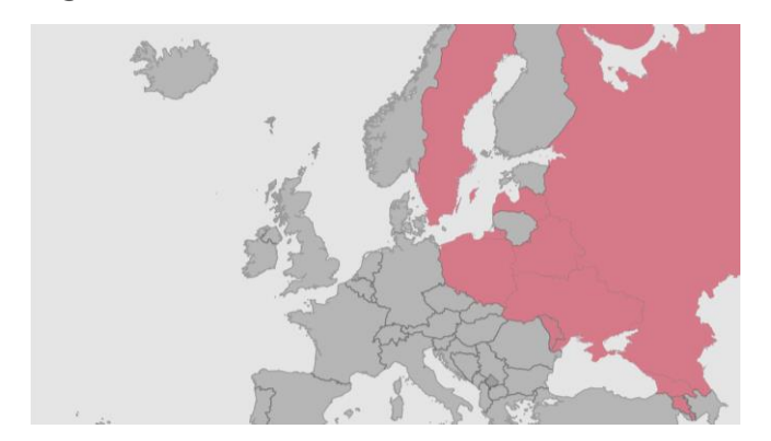
Figure 2: FREE Network Countries.

experiences and to add some interpretations and insights to the crude statistics, which often become unintelligible in the current overflow of information.